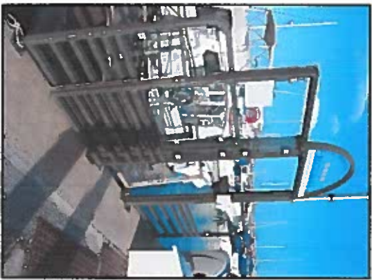
Image of Similar Type Gangway Access Gate