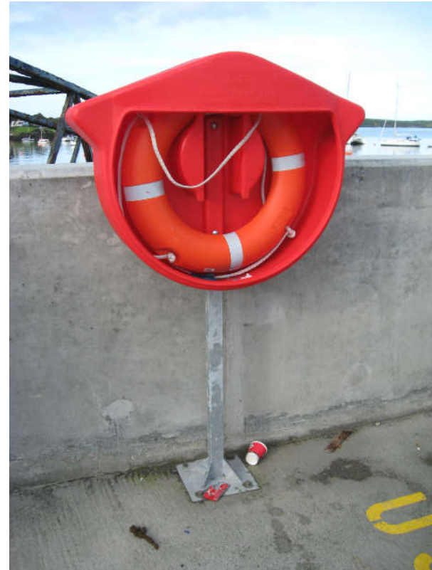
Typical Lifebuoy Stand