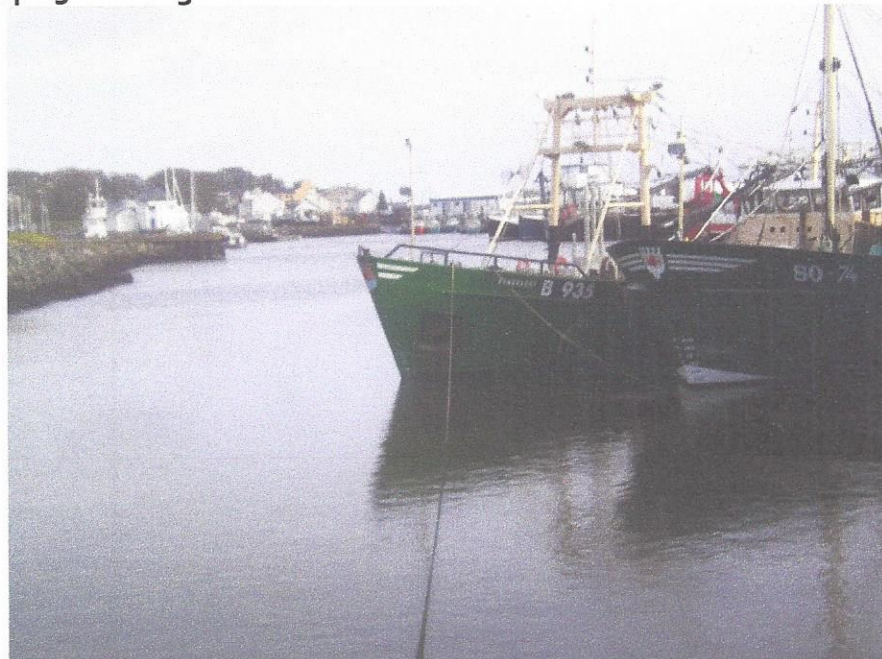
Photograph 5 shows the congestion at the entrance to Greencastle Harbour.