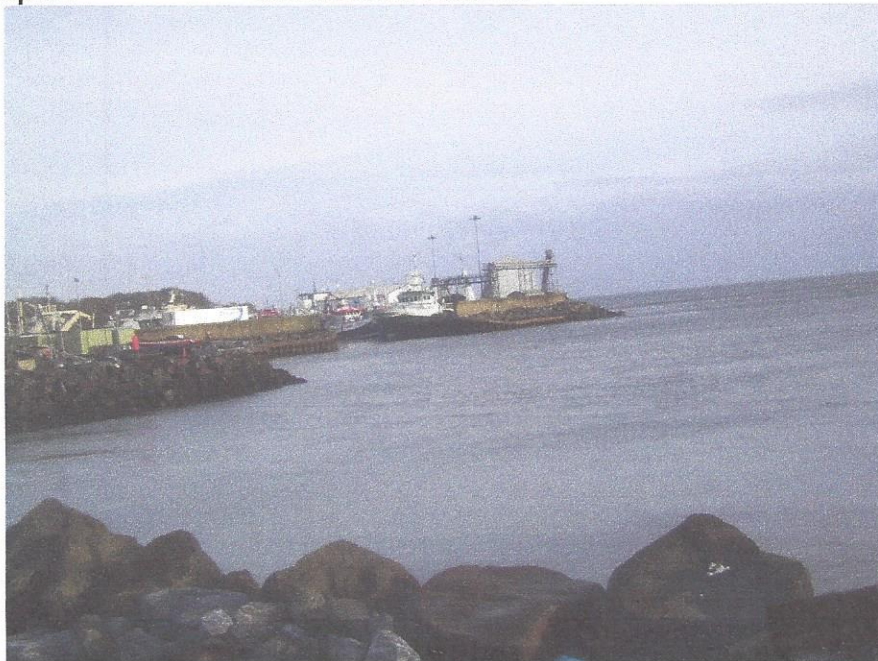
Photograph 1 Greencastle Harbour

Donegal County Council are working with the local community in Greencastle to provide mooring facilities for the many pleasure craft and cruise liner tenders that visit Lough Foyle and the environs. This facility will encourage pleasure boats and cruise ships to visit Greencastle and help the local economy. The additional benefit will be a reduction in the ongoing congestion in Greencastle Harbour. The cruise liner tender berth and pontoon facility is located 250m South West of the existing harbour and are located adjacent to the partially constructed breakwater.