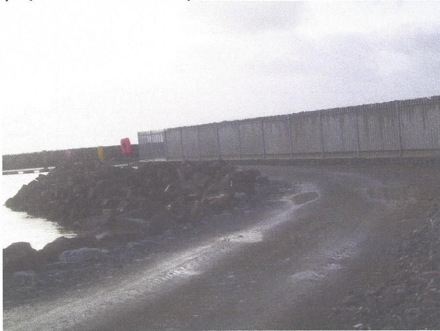
Photograph 4 shows the existing coastal pathway leading from Greencastle village to the proposed site.