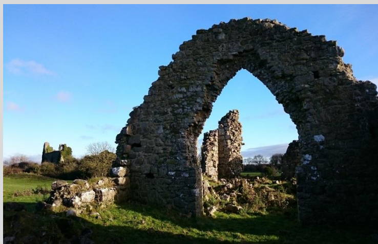
Rindoon Medieval Town – Church ruins with Castle in the background

The local community over the past ten years have worked in partnership with the Heritage Council's Irish Walled Towns Network and Roscommon County Council to save much of what survived. The Heritage Council have provided the vast majority of funding to conserve the town wall, parish church, mill and medieval hospital. A survey of the impressive but ruinous castle was also supported and numerous public awareness events have also been held.