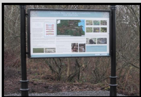
Trail Signage Information Panel

This project is a perfect example of a local community group and the Department of Culture, Heritage and the Gaeltacht working together to highlight the conservation benefits of our unique raised bogs while also increasing its rural tourism and recreational potential.