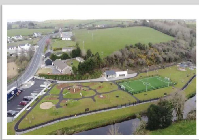
After: Abha Bhán Park, fully developed

The Park was purpose-built. Designed to be suitable for all ages and fully accessible, it includes a wheelchair usable trampoline and a carefully-built sensory garden. This means no child or adult is excluded. The park includes a playground made from natural materials (natural grass surfaces), a floodlit astro-turf pitch and outer walking/running tarmac path. The space is carefully planned including benches and seated areas suitable for picnics, all located on the 2.5 acre site, surrounded by natural trees, shrubs and wild flower meadow making it a haven for biodiversity.