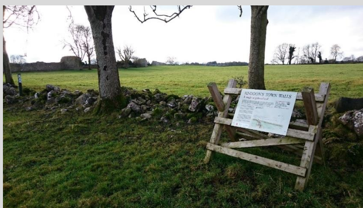
Rindoon Medieval Town – Interpretive Signage

To date a sum of €482,771 has been invested by the Heritage Council in this complex over the period 2010-18.