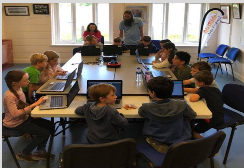
Corrib Kids Computing and Coding Club

Future plans include more technology clubs in Gaelscoils throughout Galway, with one starting in Knocknacarra in September 2019 and more charity workshops in partnership with tech companies. Local events are another area of expansion, with workshops at Brigit's Garden this year for the launch of their new Earth Quest science garden. In-school coding lessons are also in demand, with one course already completed at Collinamuck in Moycullen and two more in planning for St Annins Roscahill and Castlehacket NS in Tuam. The number of clubs booked for 2019 has doubled and they hope to continue this trend into the future.