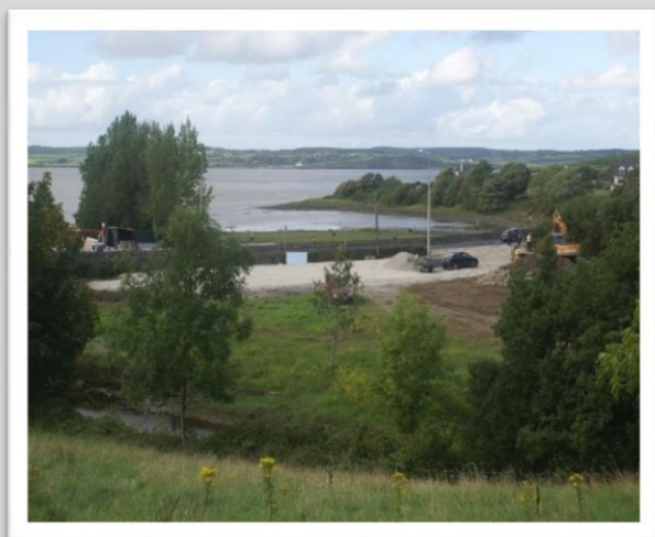
Before: View of works from the Abha Bhán River

Developed on a greenfield site, the Park is situated on the Shannon Estuary Way/Wild Atlantic Way, on the N69, running adjacent to the Abha Bhán (White River).