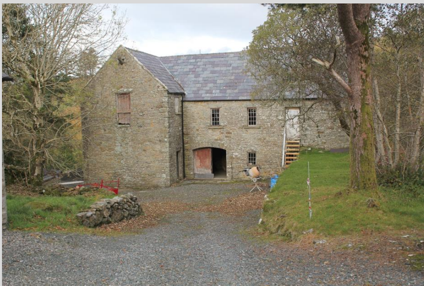
Leitir Corn Mill

This picturesque small-scale corn/oat mill complex is an important element of the built heritage of the Cill Chártha/Kilcar region, and of the industrial archaeology of Donegal. It has received funding under the Built Heritage Investment Scheme (BHIS) and retains much of its early fabric including natural slate roofs, timber windows and sheet doors. The rubble limestone construction and the irregular spacing of the openings give it a distinctly vernacular appearance. Of particular importance is the survival of the iron breastshot water wheel and sluice mechanism, which provides an insight into historical industrial methods. This waterwheel was powered using water stored in an adjoining mill pond, which was filled with water diverted from the Glenaddragh River along a headrace.