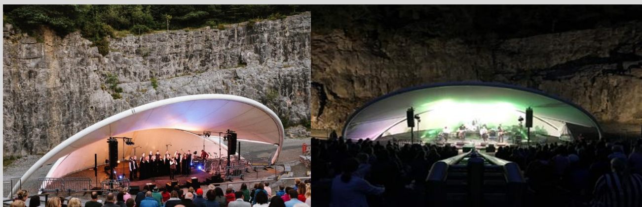
Ballykeeffe Amphitheatre, Kilkenny

The Amphitheatre can seat up to 800 on its tiered limestone benches, and boasts a state-of-the-art canopy which perfectly complements the astounding natural acoustics of the high quarry walls, providing an unrivalled experience for those attending the array of musical and theatrical performances hosted here. The venue is also fully wheelchair accessible.