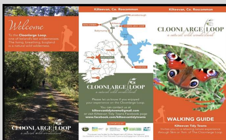
Clonlarge Loop Walking Guide

In 2019 the group have been awarded funding to further enhance the tourism, educational and recreational developments of the Clonlarge Loop. This will include the installation of a recycled plastic boardwalk and seating area next to a bog pool with information panels on the wildlife that inhabit the Pool.