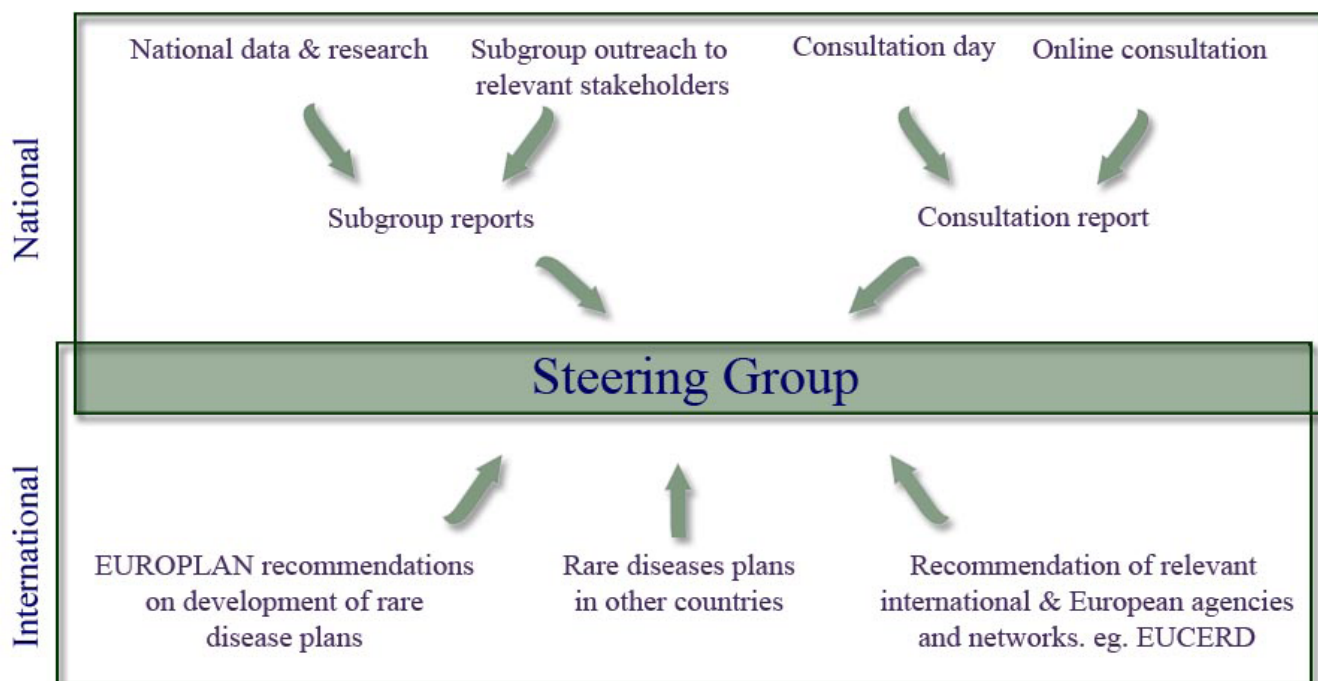
Figure 1: Key determinants that informed the development of Ireland's first National Rare Disease Plan