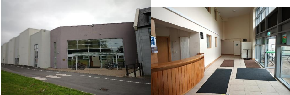
Pic1. – Main entrance