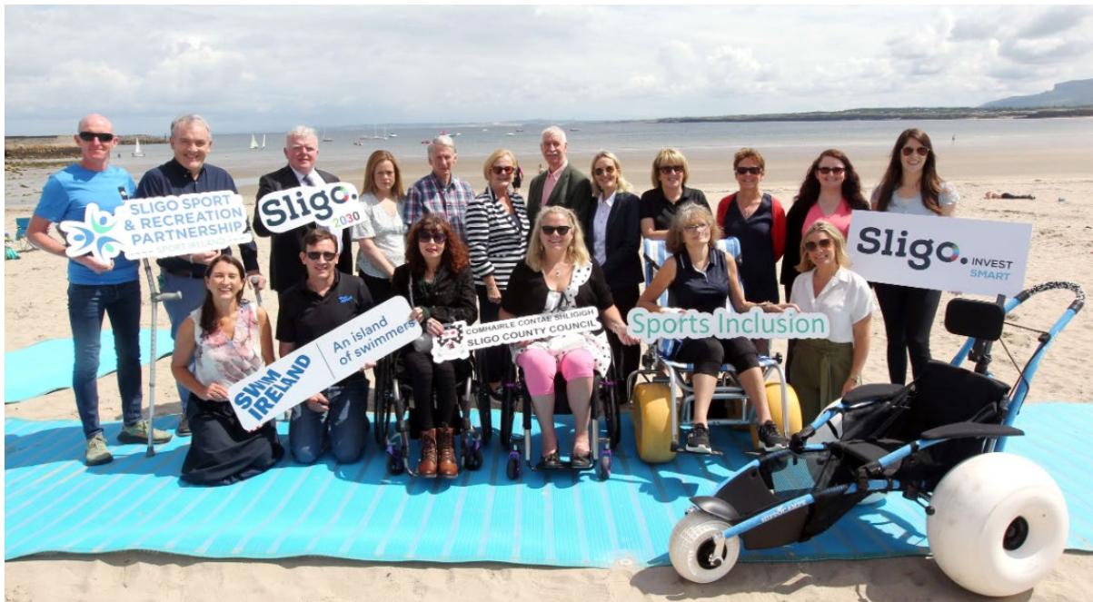
Representatives at the launch of the 'Mullaghmore Beach Access for All' in July

Sligo County Council , supported by the Department of Children, Equality, Disability, Integration and Youth officially opened the 'Mullaghmore Beach Access For All' initiative during the Summer.