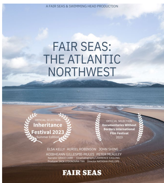
Official Movie Poster for the documentary

A short film featuring the views of local coastal communities from Donegal and Sligo who depend on the sea to make a living is set has recently received its online premiere.