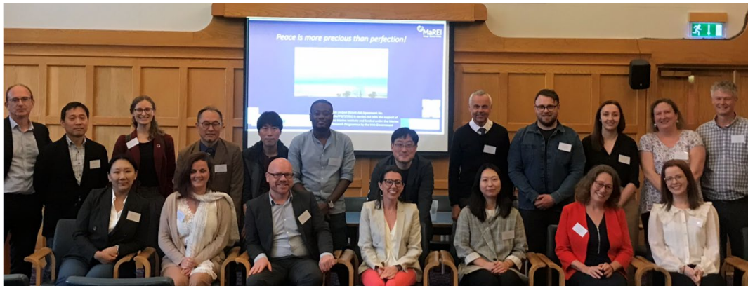
Delegates attending the QUB conference in September