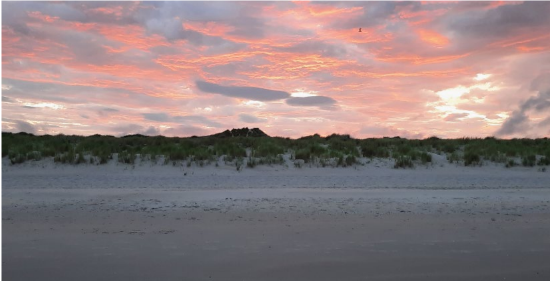
A beautiful photo of Curracloe Beach, Co. Wexford as dusk draws in