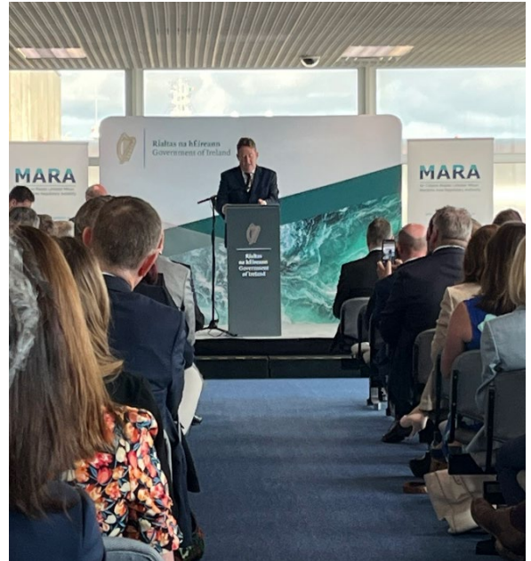
Minister Darragh O'Brien TD speaking at the launch of MARA

MARA will be a key enabler in respect of Ireland's ambitions for the Offshore Renewable Energy (ORE) sector. It will also support delivery of other projects of strategic importance (including cabling and telecoms projects, ports development, drainage projects, sewerage schemes etc.), facilitating the State to harness significant benefits from realising a low-carbon economy, ensuring energy security, and presenting new opportunities for economic growth. If you would like more information about MARA and its functions, or on any aspect of the new planning system for Ireland's maritime area, please contact MARA at: info@mara.gov.ie