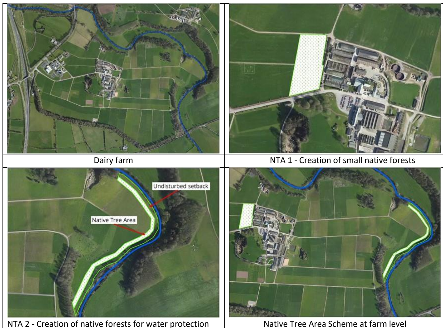
Figure 2. Native Tree Area Scheme example.