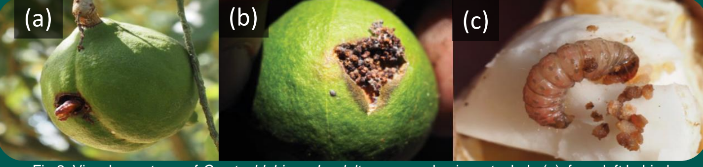
Fig 2: Visual symptoms of Cryptophlebia ombrodelta on macadamia, entry hole (a), frass left behind from boring into nut (b) and (c) typical larvae found within infested nut/fruit/pod