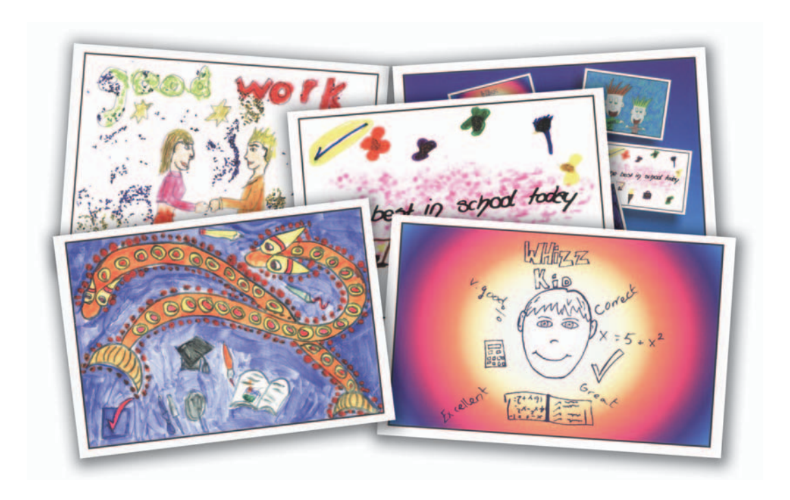
Figure 7.1 JCSP postcards

A unique feature of the JCSP is the series of special postcards for use by teachers.