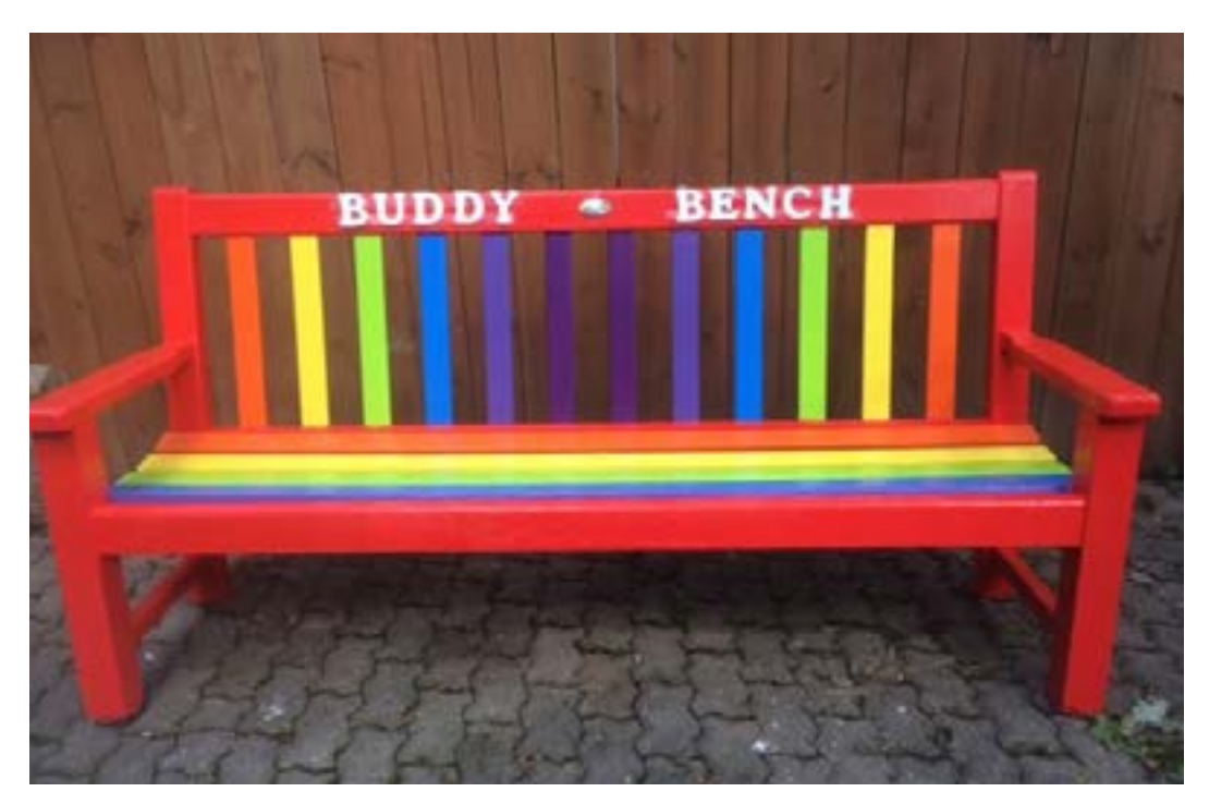
A 'Buddy Bench' initiative was introduced in many schools in Ballymun, Dublin

When a young person comes out as lesbian, gay, bisexual or transgender they are disclosing their sexual orientation or gender identity. It is a statement about an aspect of the student's identity and should not be interpreted as an indication of sexual behaviour.