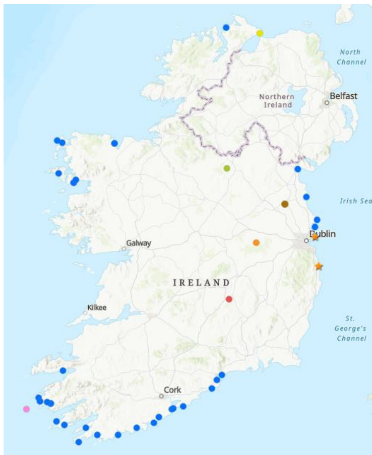
Fig. 2. Locations of H5N1 avian influenza cases in wild birds and outbreaks in captive birds in Ireland since 1 st July 2022