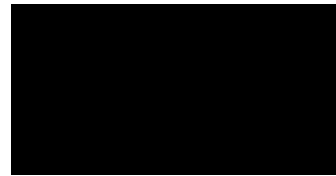
Nina Murray (Housing)

DIVISION: Foreshore DECISION BY: 08/06/2022