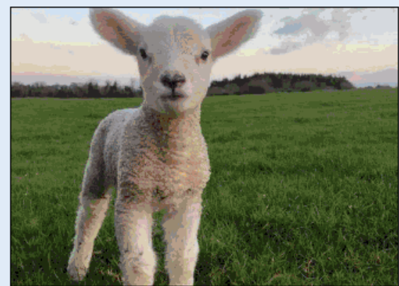
Anyone who has made bookings for Glenroe Farm have been contacted and refunded.