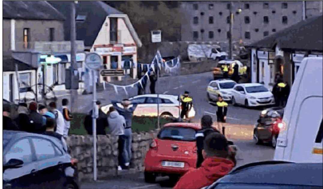
The scene in Castlebridge on Sunday evening.

The injured garda is expected to make a full recovery. "He took some wallop," a garda source said. "He got medical treatment for it. He was brought to hospital, but he seems to be doing okay."