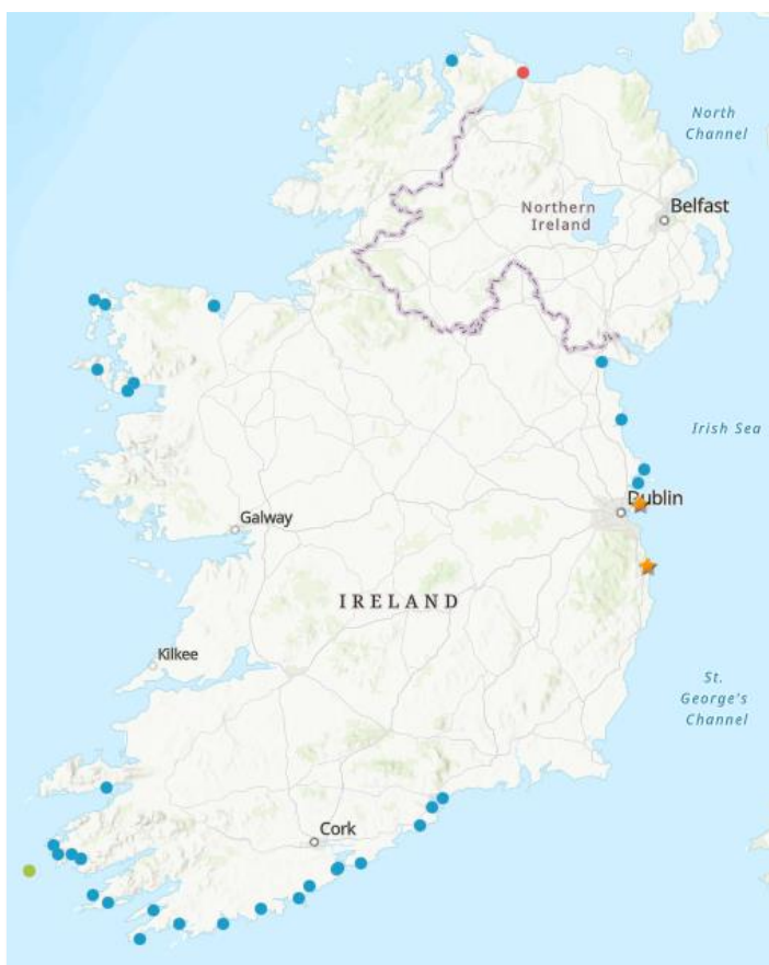
Fig. 1. Locations of H5N1 avian influenza cases in wild birds and outbreaks in captive birds in Ireland since 1 st July 2022