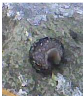
Plate 1. The Kerry slug is the only Irish slug able to curl into a ball. This makes measurements of live adults difficult.

National Roads Authority, 2009. Ecological Surveying Techniques for Protected Flora and Fauna during the Planning of National Road Schemes. NRA, Dublin.