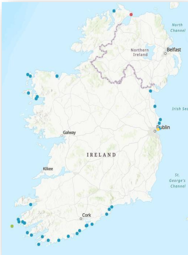
Fig. 1. Locations of H5N1 avian influenza cases in wild birds and outbreak in captive birds in Ireland since 1 st July 2022