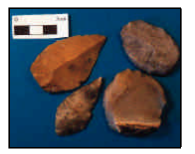
Stone tools are sometimes the only obvious remains from prehistoric sites.