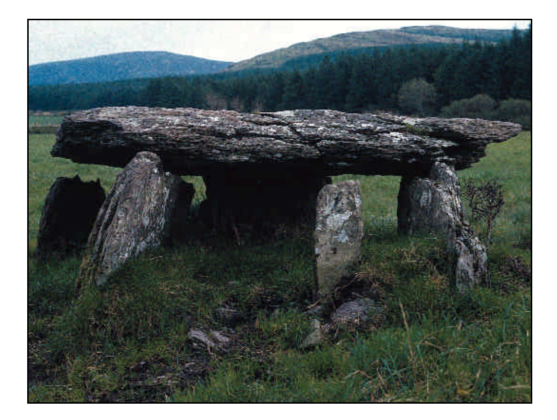
Megalithic tombs occur throughout the countryside and are particularly vulnerable to damage from forest operations.