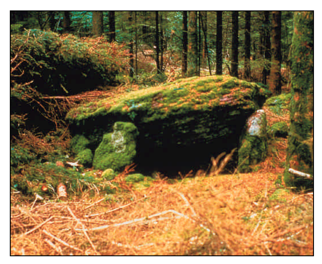
Megalithic tomb within a forest plantation.

The Forestry and Archaeology Guidelines have been compiled to assist non-archaeologists involved in forest development to identify archaeological sites, and set out the procedures which should be followed to avoid site disturbance.