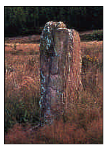
Standing stones are usually associated with burial or ritual sites.