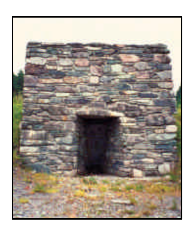
Post-medieval and industrial sites, like this limekiln, must also be protected.

Archaeological artefacts will often be uncovered in the course of ground disturbance. Objects such as pottery, stone and bronze axes, quern stones and flint artefacts should not be disturbed once uncovered, as they may indicate an archaeological site in the area. The relevant authorities must be notified if any such discoveries are made, and the finding of objects reported to the National Museum of Ireland.