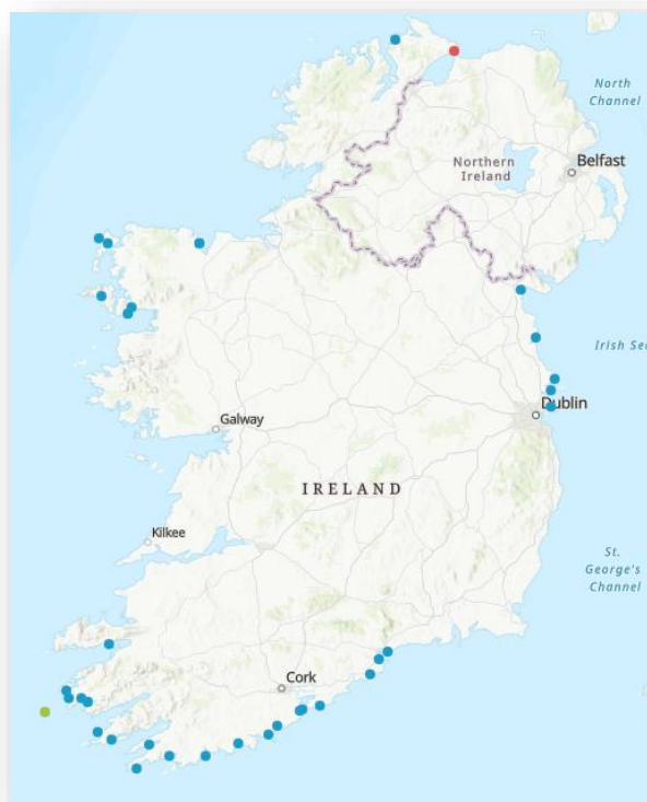
Fig. 2 Locations of cases of avian influenza H5N1 in wild birds in Ireland since 1st July 2022