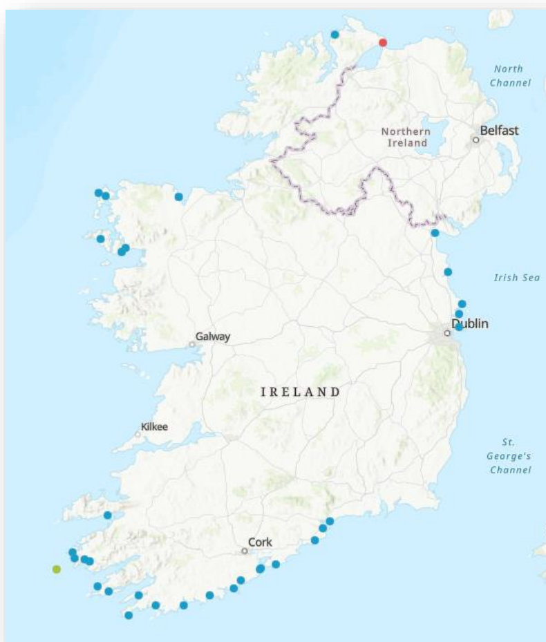
Fig. 4. Locations of cases of avian influenza H5N1 in wild birds in Ireland since 1 st July 2022