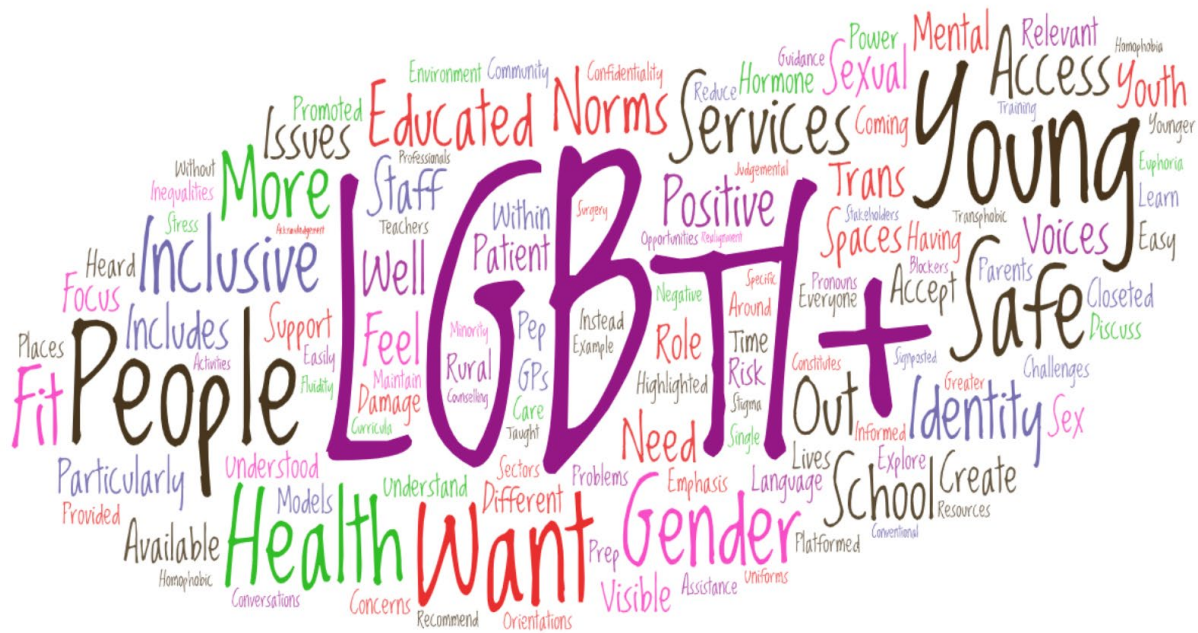
Figure 2. Word cloud of recommendations from LGBTI+ young people

professionals to have training in LGBTI+ issues, and to be able to access services without stigma. They want access to Pre- and Post-Exposure Prophylaxis to be available, and trans-specific health care to be more easily available, including hormones, pubertal blockers and gender realignment surgery.