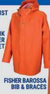
FISHER BAROSSA BIB & BRACES