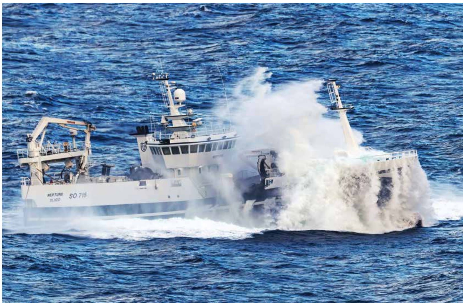
Neptune SO715 passing Sumburgh heading west during the mackerel season

Seafood Task Force Report Delivers Grim Future For Irish Fishing. See Pages 2-6