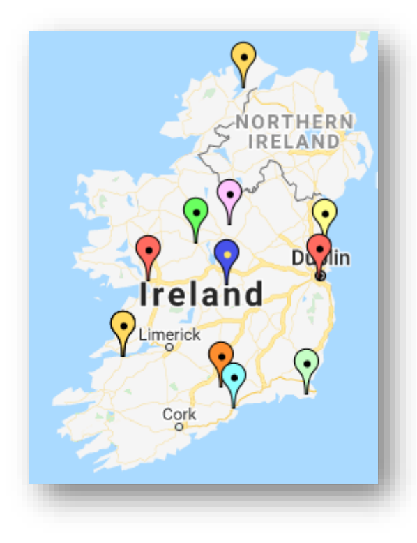
Figure 2. Map of Ireland indicating locations and bird species involved in confirmed avian influenza subtype H5N1 cases from Oct 1<sup>st</sup> -9<sup>th</sup> December 2021