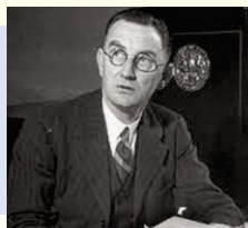
Oscar Traynor - Republican Fighter and Visionary Politician