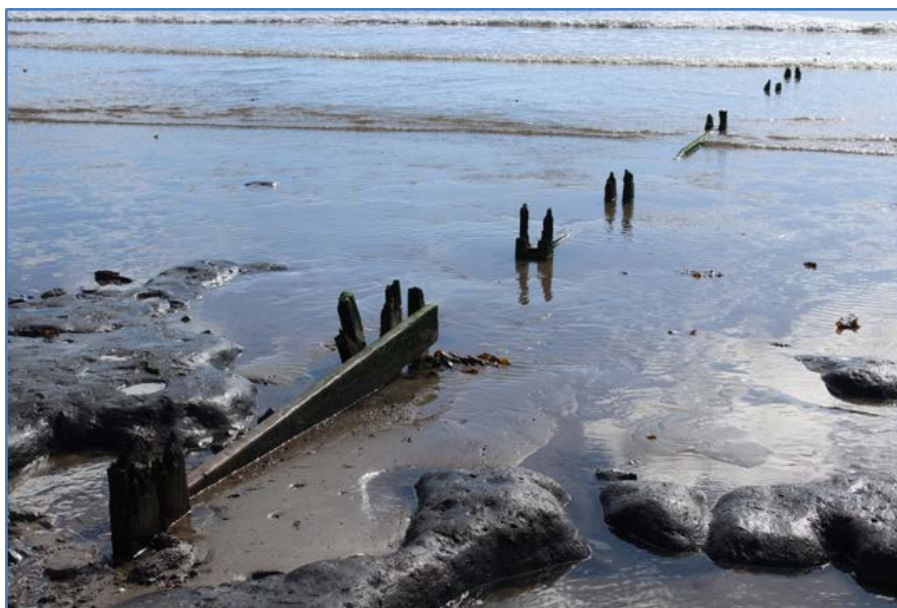
Figure 14 Remains of a groyne on Claycastle beach (facing south-east). Note the exposed peat deposits in the foreground.