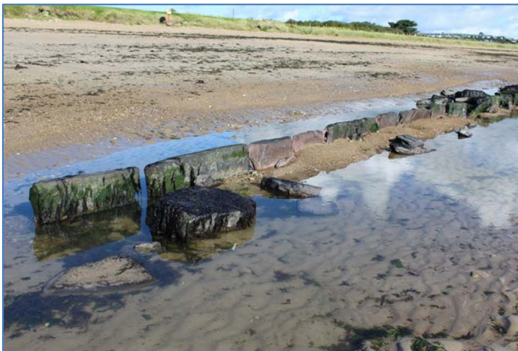
Figure 15 Possible beach defences (CA 3042) along the shoreline (facing north-west)