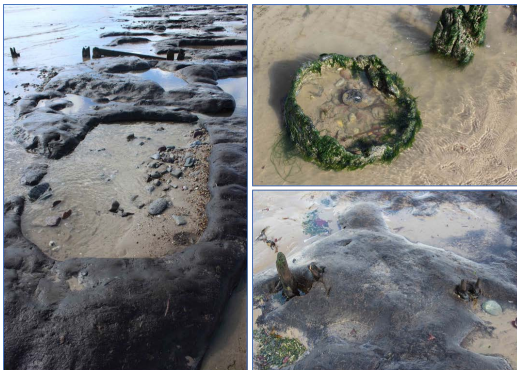
Figure 13 Walkover findspot examples - left recti-linear cut in peat (CA3007- facing north-east); top right - possible pot (CA3001 – facing north); bottom right – wood protruding from exposed peat.