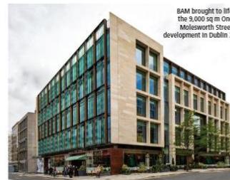
BAM brought to life the 5,000 sq m One Molesworth Street development in Dublin 2

Most significantly BAM has achieved leadership status with the global Carbon Disclosure Project, earning a performance rating of A, which means it now ranks among the top companies in the world in reporting and tackling climate change. Operationally, BAM has reduced its CO 2 emissions by 70 per cent since 2004 and is committed to working