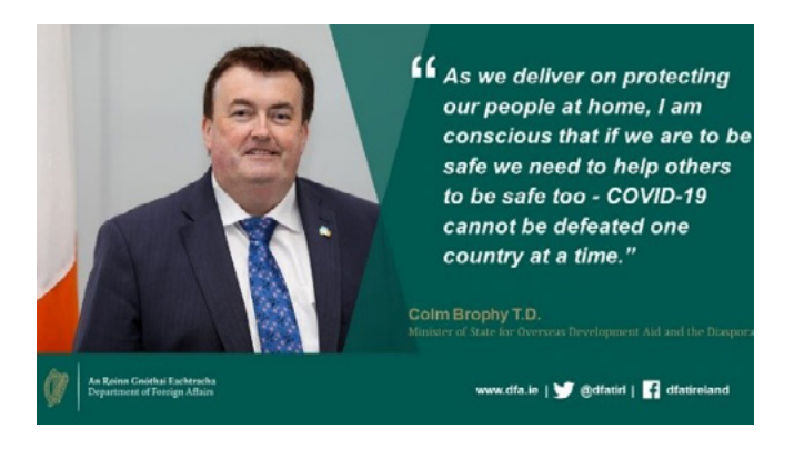
Minister of State for Overseas Development Aid and the Diaspora, Colm Brophy, T.D., announcing Irish Aid support for COVID-19 vaccines in developing countries.