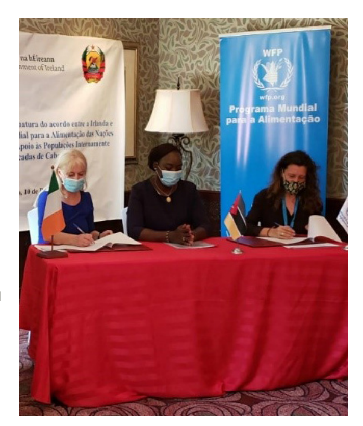
Ambassador to Mozambique, Nuala O'Brien, signing an agreement to provide €2.2m towards WFP's humanitarian response in support of internally displaced people in northern Mozambique, 10 December 2020.

The pandemic has impacted on or delayed some areas of Africa Strategy implementation in 2020, such as trade and cultural promotion work, and the convening of a number of EU-Africa meetings. Nevertheless, the Strategy's focus on deepening political partnerships to address regional and global problems, and on strengthening Ireland's contribution to peace, security and sustainable economic growth and development, has been reinforced by the global nature of the COVID-19 pandemic and by its geopolitical and socioeconomic consequences. The Strategy remains relevant for Ireland's engagement with African partners and as a global actor, including on the UN Security Council and in our ongoing global response to the COVID pandemic.