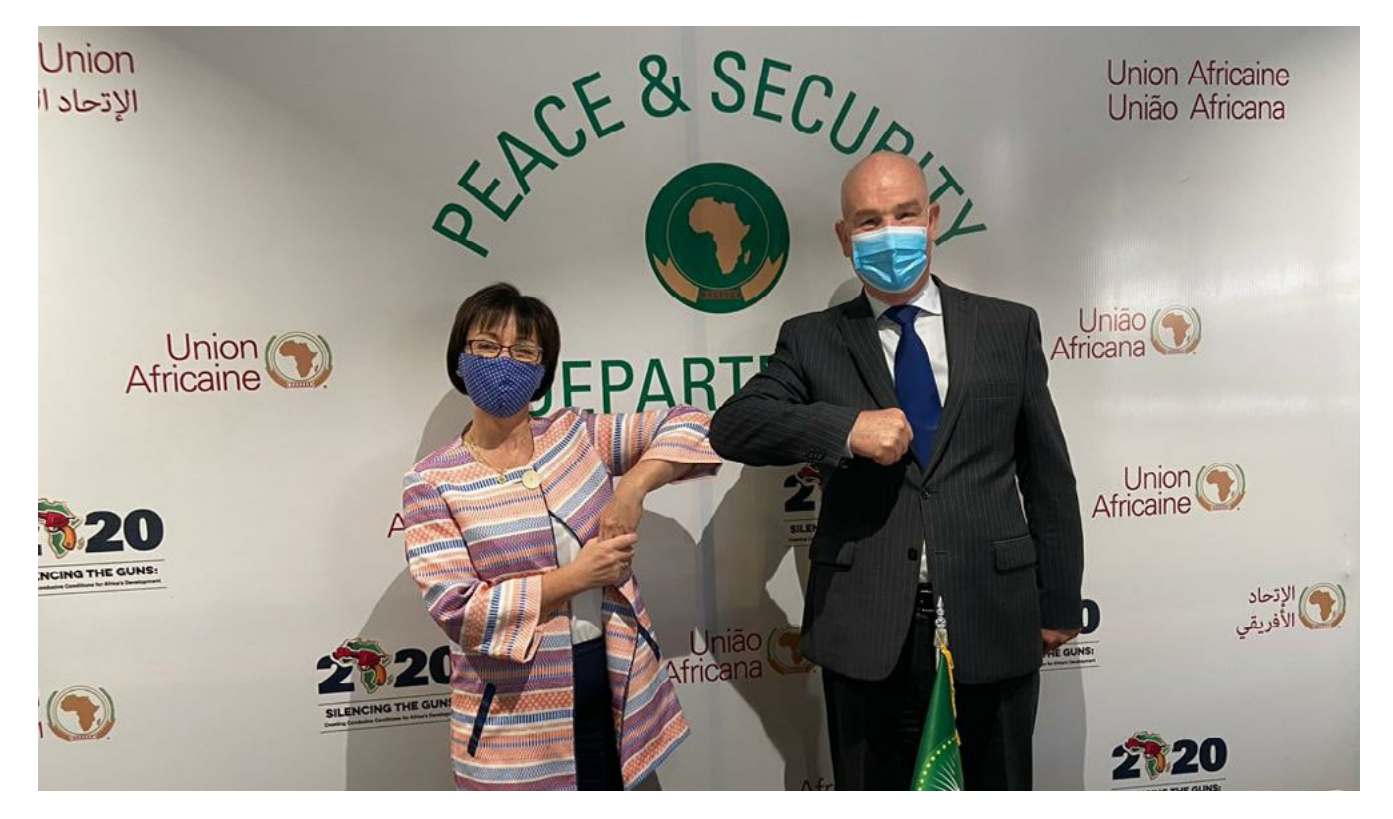
Ambassador to the African Union, Nicola Brennan, meeting the African Union Commissioner for Peace and Security, Smail Chergui, Addis Ababa, 5 November 2020.

In order to enhance Ireland's capacity for analysis and political engagement on crisis situations in Africa, the Department of Foreign Affairs has strengthened relations with key research organisations working on African issues. Structured engagement with research organisations took place in the preparations for UN Security Council membership.