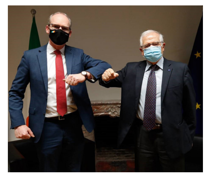
Minister for Foreign Affairs and Minister for Defence, Simon Coveney T.D. with EU High Representative/Vice-President Josep Borrell Fontelles.

Advancing peace, security and respect for human rights and the rule of law became more challenging everywhere as a result of the COVID pandemic. Nevertheless, there were some positive developments in Africa, in which Ireland played a constructive role. Ireland continued to deploy Defence Forces personnel to UN and EU Missions in Africa. The peaceful re-run of an election in Malawi was supported both through advocacy and financially by Ireland, and through an EU election observation process. Ireland took on a leadership role in responding to the outbreak of armed conflict in Tigray in November, establishing a group of likeminded humanitarian donors to coordinate advocacy with the Government of Ethiopia. Minister Coveney initiated dialogue with key regional interlocutors in November 2020 and has continued to provide leadership on the issue. Since joining the UN Security Council, Ireland has worked consistently to ensure a focus on the conflict in Ethiopia, initiating discussions at the Council in February and March, and leading negotiations that led to adoption of a press statement on the situation in Tigray on 22 April - the first time the Council spoke publicly on the crisis. Ireland also supported the implementation of the 2019 Peace Accord in Mozambique and responded to the deteriorating humanitarian and security situation in Cabo Delgado.