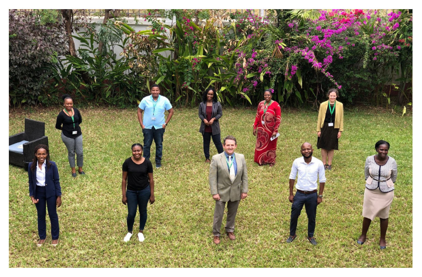
Ireland-Africa Fellowship Programme candidates at Embassy of Ireland to Tanzania, Dar es Salaam, August 2020.

In 2019, IDA Ireland established a presence in South Africa with a Pathfinder to complement and support IDA's efforts from Ireland to win new investment from South Africa. This has resulted in two new name investments from South African companies, as well as an expansion project approved by the IDA Board in 2020/2021. Most notably, in June 2020, IDA welcomed South Africa's largest animation studio to Galway, which was the company's first international expansion outside of South Africa. The company is expected to create 60 jobs in Galway over the next three years. There are now 14 South African IDA assisted companies with FDI operations in Ireland, employing over 770 people in key sectors including technology, financial services and life sciences.