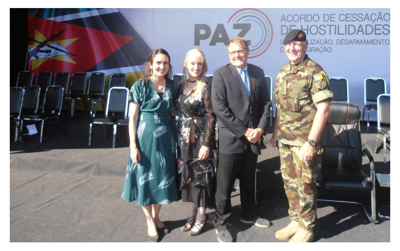
Ireland supports the implementation of the 2019 Peace Accord in Mozambique.

Likewise, in Mozambique , home to our second-largest bilateral development cooperation programme, Ireland continues to support the implementation of the 2019 Peace Accord with both financial and technical assistance through the deployment of a member of the Defence Forces. In addition, in response to the deteriorating situation in the north of the country, where a violent insurgency has been underway since 2017, Ireland is actively engaged in humanitarian response efforts in support of more than half a million people displaced from their homes by violence. Ireland's humanitarian assistance amounted to \notin 4.3 million in 2020.