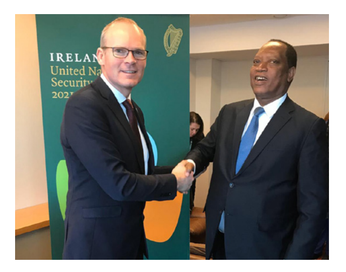
Minister Simon Coveney T.D. with Foreign Minister of Tanzania, Palamagamba John Kabudi, February 2020.