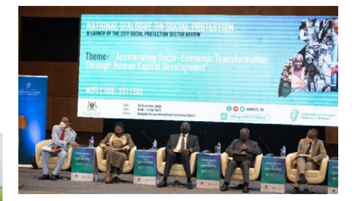
Panel discussion at Uganda's National Dialogue for Social Protection 2020, organised by Ireland as Chair of Uganda's Social Protection Donor Group.

Through our membership of the African Development Bank, Ireland supported the Africa-wide COVID-19 Response Facility which makes up to USD $10 billion of funding available to governments and the private sector. The achievement of the SDGs was a driver for membership and will continue to drive and shape our engagement with the African Development Bank. Ireland, both directly and through our Constituency, will support and champion continued provision of finance, technical assistance, policy support and knowledge, while these Goals remain at the heart of the Bank's policy programme.