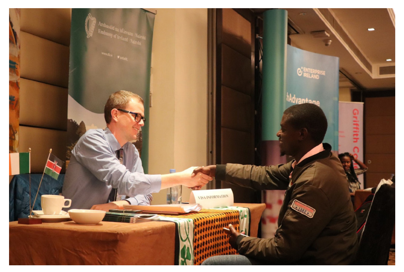
Study in Ireland Education Fair, Nairobi, Kenya, February 2020.

2020, the sixtieth anniversary of Ireland's diplomatic presence on the continent was marked by a month-long #IrelandinAfrica social media campaign, reaching over 350,000 users. In May, messaging on Ireland's work in Africa was included in the campaign for the virtual Africa Day, which reached 95,000 users. Also in 2020, a dedicated page on Ireland's work in Africa was created on the DFA website for the first time and was used in both campaigns to generate awareness about Ireland's work in the region.