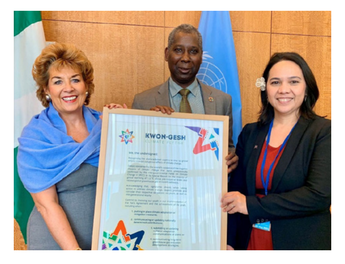
Ireland signed the Kwon-Gesh Pledge and committed to including youth in policy-making regarding climate action, New York, December 2019.

Ireland provides significant support to reducing humanitarian need in African countries. As in previous years, Somalia, the Democratic Republic of Congo, South Sudan and Sudan were the greatest recipients of Ireland's humanitarian assistance respectively, due to the protracted crises there. Additional funding was provided to partners operating in central Sahel, given the deteriorating situation there and increased political engagement by the European Union. Ireland also increased funding to partners providing safe spaces and specialised services to highly vulnerable displaced/refugee women and girls living in five African countries (Ethiopia, South Sudan, Somalia, Kenya and Cameroon). In July 2020, Ireland assumed a seat on the Somalia Humanitarian Fund's Advisory Board.