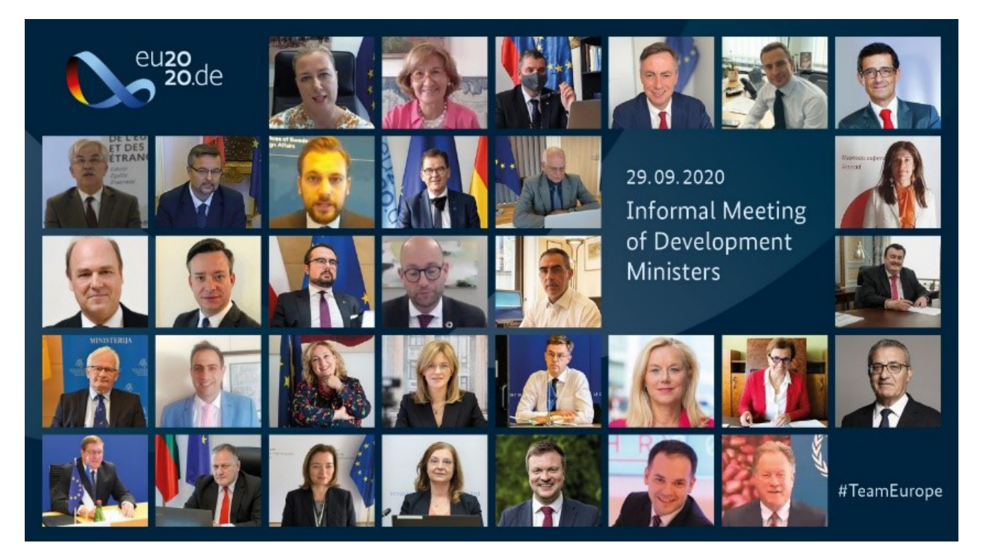
On 29 September, Minister for Overseas Development Aid & Diaspora, Colm Brophy T.D., participated in an informal video conference of the EU Foreign Affairs Council in the format of Development Ministers, focusing on relations with Africa and EU-ACP Post-Cotonou negotiations.

EU-AU relations, and the EU's new comprehensive strategy towards Africa, were discussed at the European Council in October 2020, at three Foreign Affairs Councils, at two meetings of EU Development Ministers, at five COREPER II meetings, four Peace and Security Council meetings and several times at the Africa Working Group (COAFR). Ireland actively participated in these discussions and in the negotiations of Council and European Council Conclusions on Africa in June