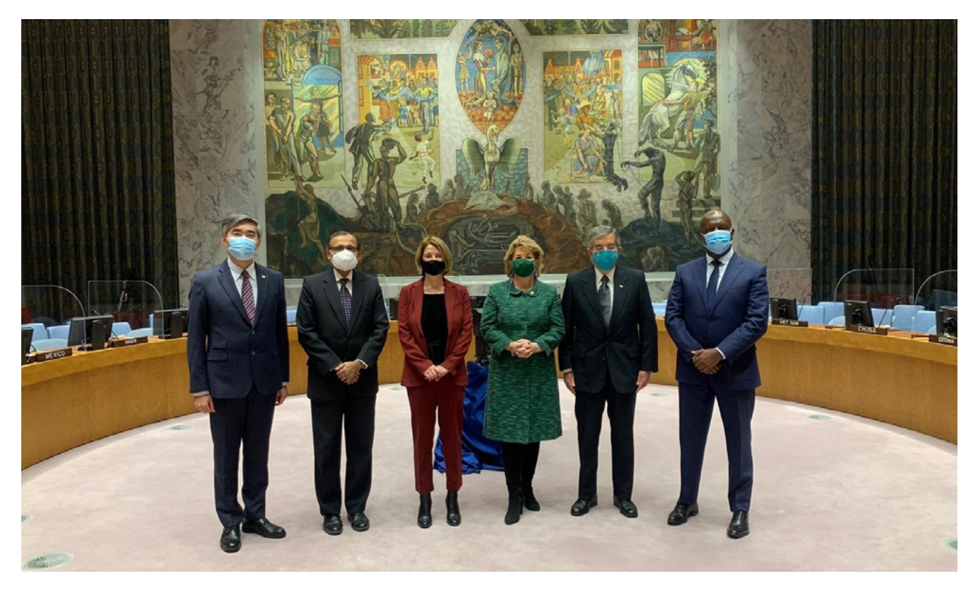
Permanent Representative to the UN in New York, Geraldine Byrne Nason, in the Security Council Chamber with UN Secretary General Antonio Guterres and the Permanent Representatives of the other four newly elected UN Security Council members (India, Kenya, Mexico, Norway), January 2021.

In December 2020, an African research organisation provided training to officials on peace and security issues from the perspective of the African Union. The Department of Foreign Affairs has also engaged an African policy and research organisation to provide technical support services to inform our engagement in the Sahel region. In 2020, the Department of Foreign Affairs engaged with civil society in Ireland on UN Security Council peace and security issues through the Stakeholders Forum convened through the Institute for International and European Affairs.