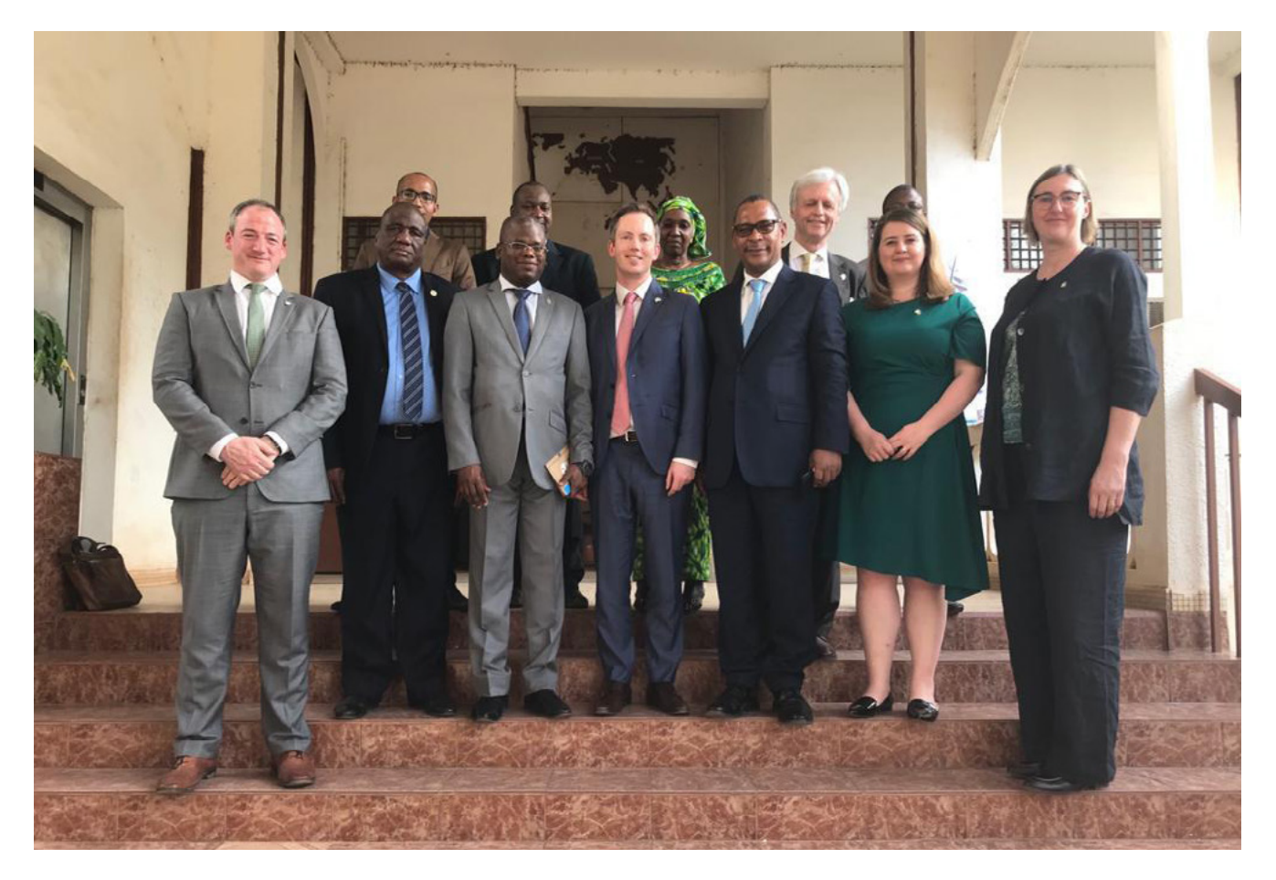
Irish Delegation at the Ministry of Foreign Affairs and International Cooperation of Mali during a scoping visit to the francophone West Africa Region, Bamako, March 2020.

The Strategy commits Ireland to expand our presence in francophone West and North Africa , including through the opening of new Embassies in Morocco and two other locations by 2025. Work advanced towards the opening of a new Embassy in Morocco in 2021. In March 2020, DFA officials conducted a comprehensive scoping visit to the francophone West Africa region in order to identify geographic and sectoral opportunities for Ireland's scaled up engagement in the Sahel and West Africa. Arising from that visit, a suite of recommendations for deeper engagement was approved and work is ongoing on the development of a roadmap to support Ireland's enhanced engagement in the region over the coming five years. A Cross-Department Reference Group was established to support the coordination of this work.