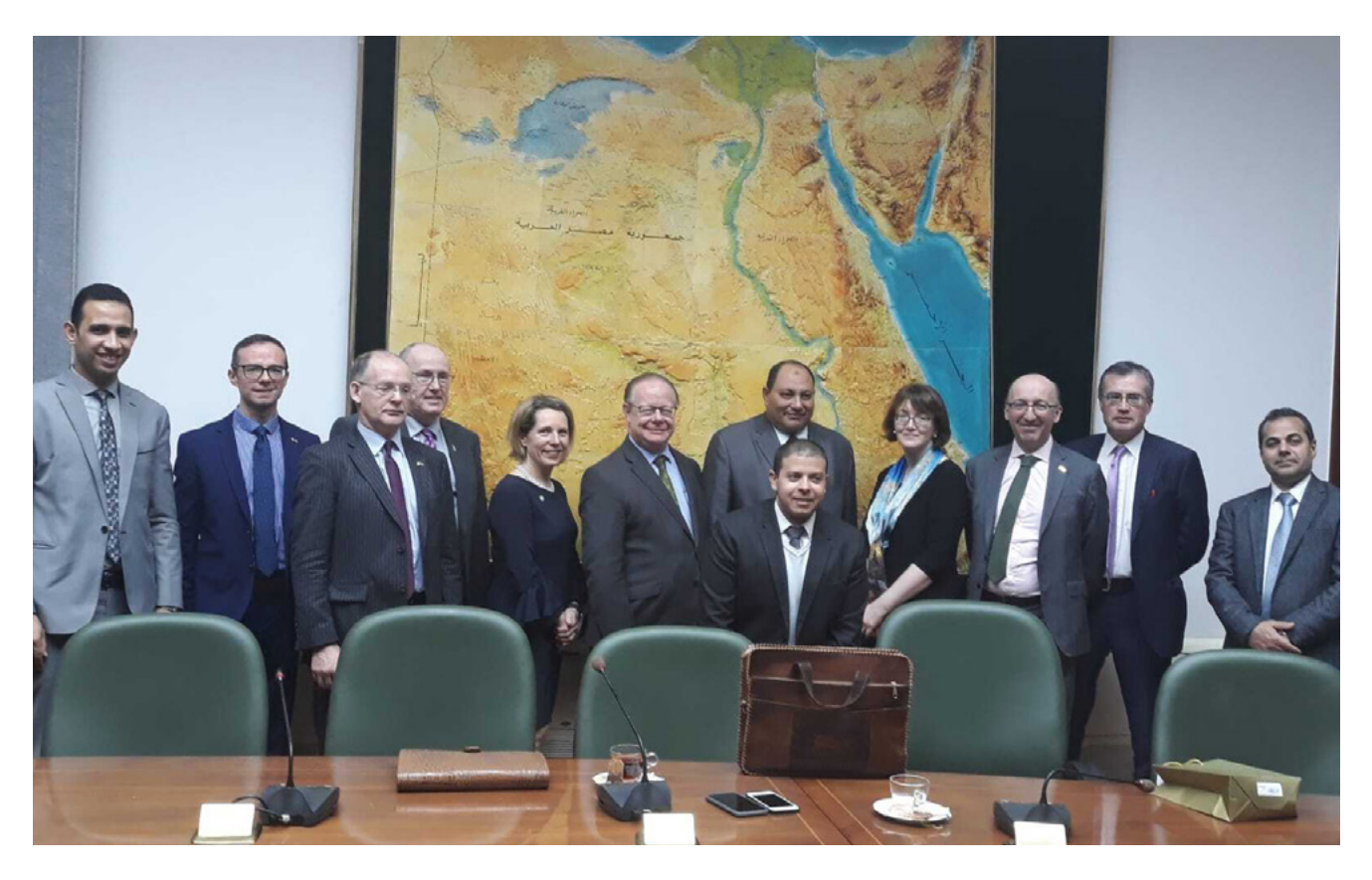
Trade Mission led by the Department of Agriculture, Food and the Marine and Bord Bia to Algeria and Egypt, February 2020.

Also of note is ongoing work to support the implementation of the African Continental Free Trade Area and African economic integration. To this end, Ireland has participated in EU expert-level meetings and has provided its perspective on how to mitigate the impact of COVID-19 on regional trade and supported effective measures to address this. Ireland continued its work in 2020 to build an enhanced trade environment and increased access to markets through support for the International Trade Centre, the World Trade Organisation Standards and Trade Development Facility, the United Nations Conference on Trade and Development Port Management Programme and, specifically in the East African region, through our partnership with Trade Mark East Africa. This support was adapted to respond to the new challenges arising from COVID-19 restrictions, for example, by supporting safe trade zones for women traders at the border between Kenya and Uganda.