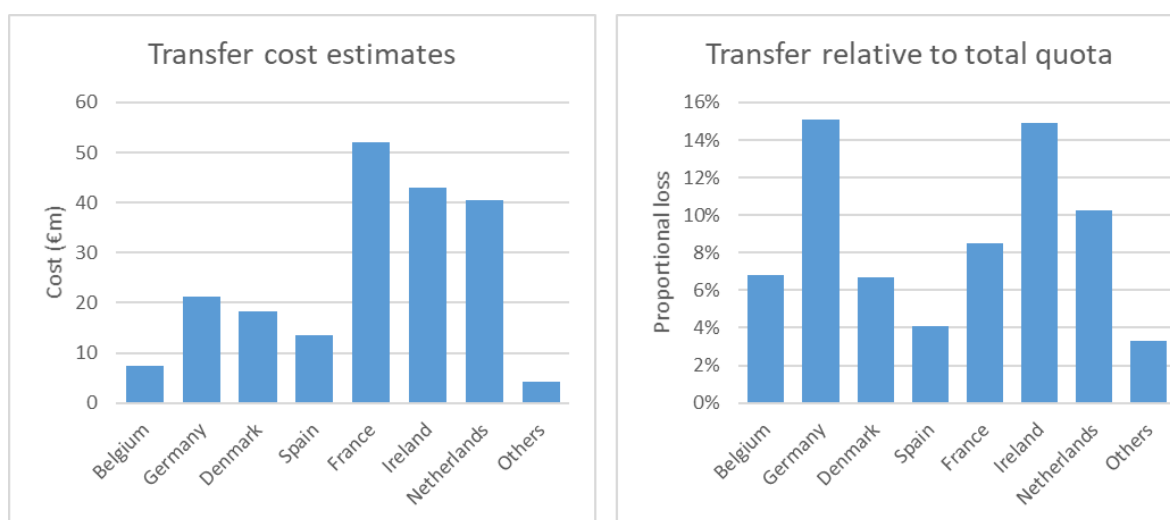
Figure 1: The value of the final (2026) quota transfer by Member State (left) and as a proportion of the value of the national quota (right).

* Note that Irish fish prices were used to estimate the value of the quota for other Member States. Results could vary if individual Member States market prices were used or EU JRC average prices