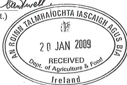
N.W.Cantwell (Capt.) Nautical Surveyor