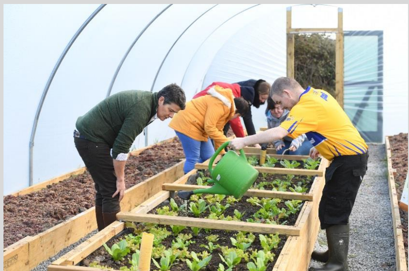
Social farming in Kerry

Host farmers, participants and guardians have all been extremely positive about the Social Farming model. There is a strong desire to continue with the programme and to help expand it where possible to involve more participants and host farmers.