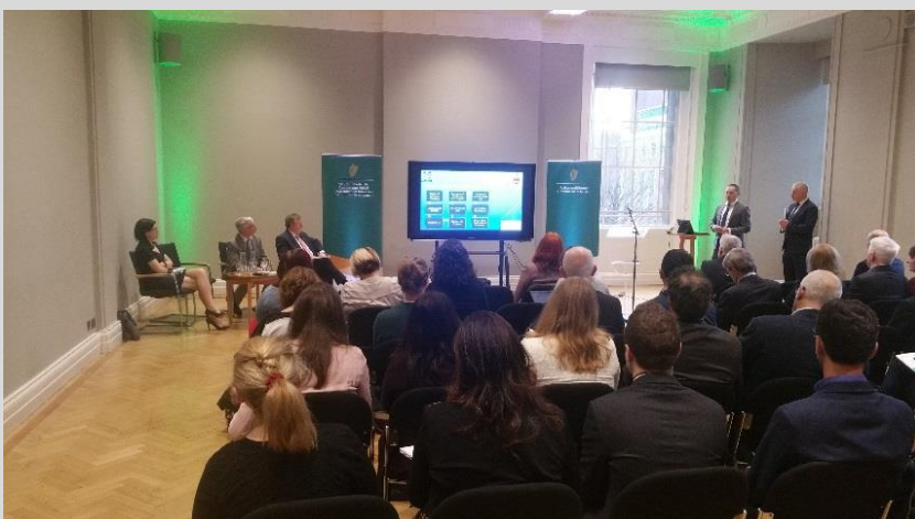
Broadband Officers at the Telecommunications Action Group meeting February 2019

They are also involved in a number of other initiatives in their functional areas, including the Smart Communities Initiative which was recently launched in Tubbercurry, and the Development of the Digiwest network of Rural Digital Working Hubs which recently received funding under the Rural Regeneration and Development Fund, and which will see Hubs established in Swinford Co. Mayo, Stranorlar, Co. Donegal, Tulsk, Co. Roscommon and Tubbercurry, Co. Sligo, in partnership with the Western Development Commission.