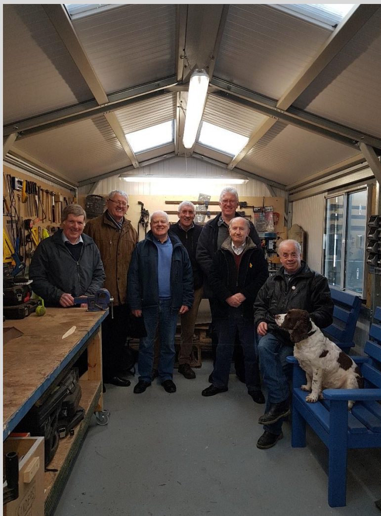
Members of Terenure Men's Shed

In 2018, the Department of Rural & Community Development provided a ring-fenced €500,000 Men's Shed Fund for sheds throughout Ireland.