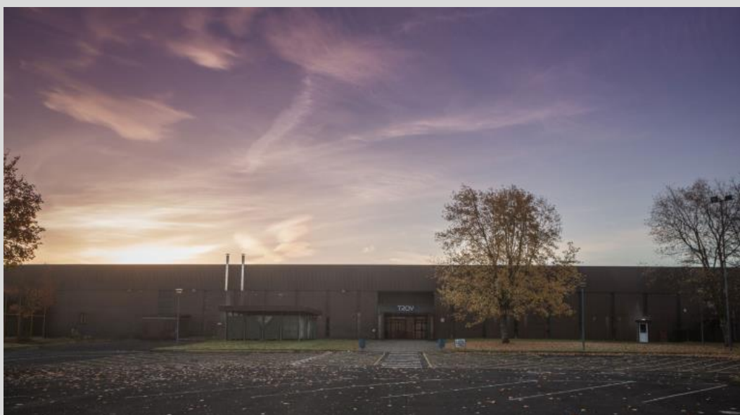
Troy Studios, Limerick

Troy Studios is committed to building a highly skilled local crew base in the medium term; forged strong links with higher education institutes in the region including University Limerick and Limerick School of Art and Design with over 3,700 students engaged in creative studies. It intends to develop a new Training Studio of 2,150 Sq ft as part of expansion plans.