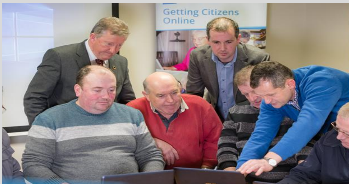
Digital Skills session in Tubbercurry, Co. Sligo with Minister of State Sean Canney

Further details on the Scheme and the National Training Schedule is available at www.dccae.gov.ie/digitalskills